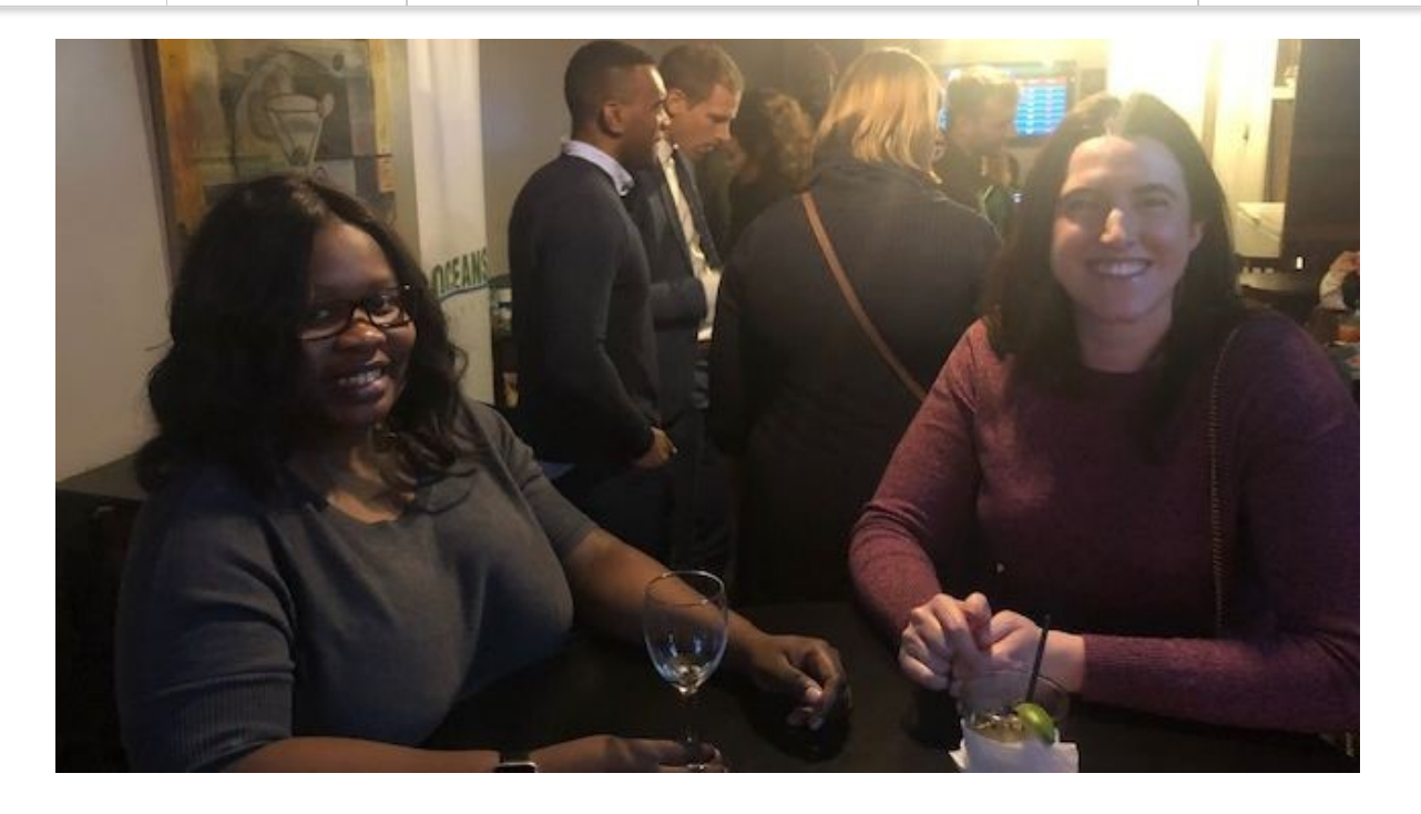
OCEANS Networking in Washington, DC